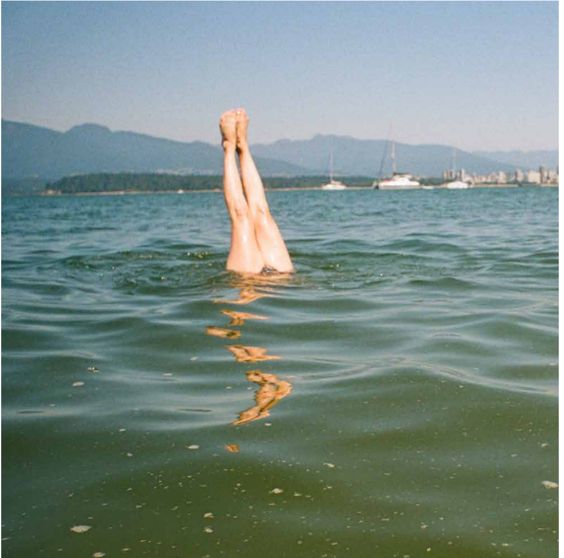
Jericho Beach, Vancouver, British Columbia.