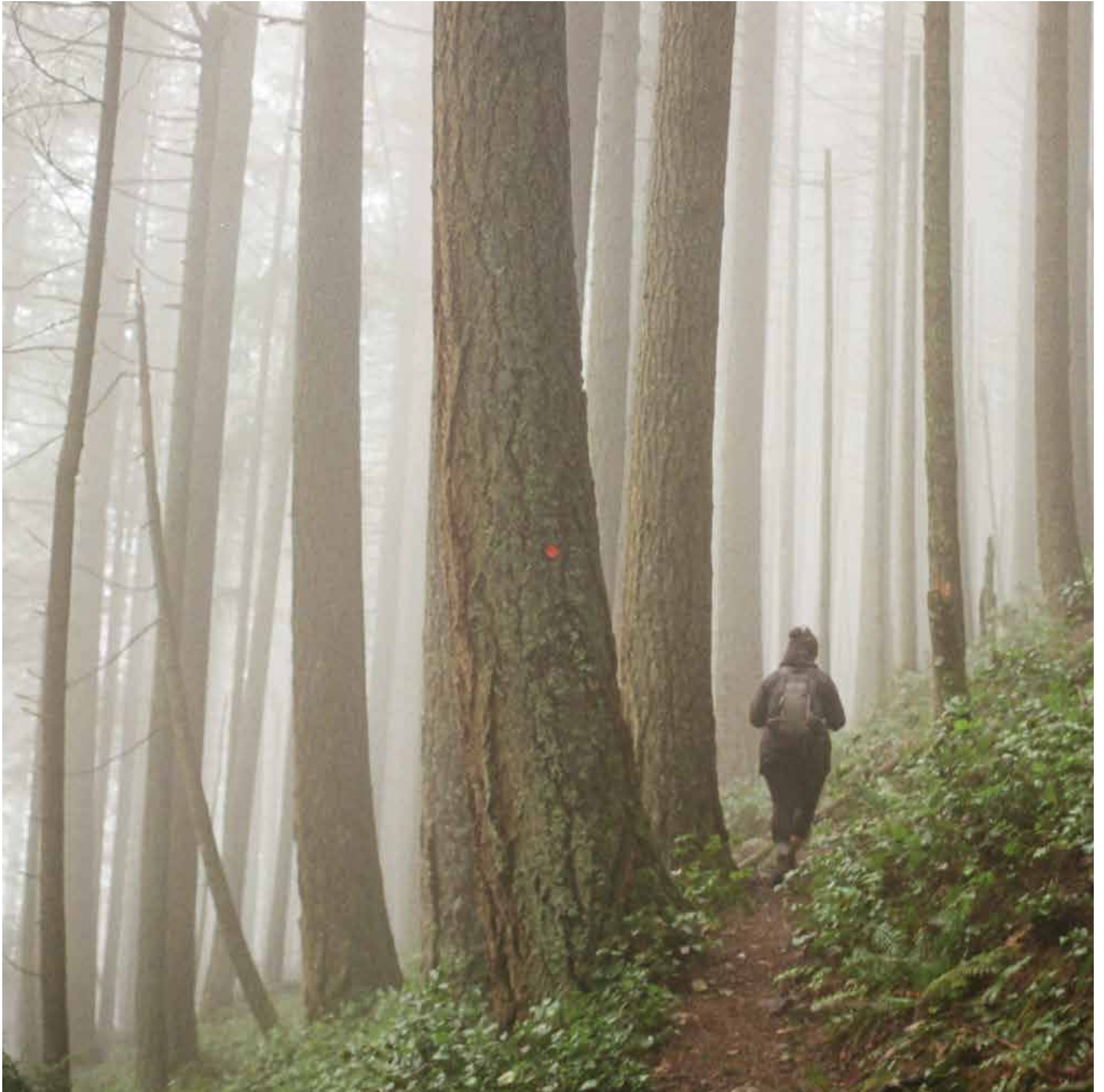
Bowen Island, British Columbia.